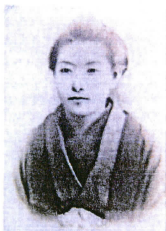
← Portrait in her last years

In this museum, original manuscript of Takekurabe , oblong cards of tanka poetry in her own hand, letter addressed to Tosui Nakarai (her respected teacher), and other documents are displayed. Also, this museum exhibits a street of Ryusenji where she lived, her desk, the miniatures of the Takekurabe world, and contemporary culture and daily life materials.