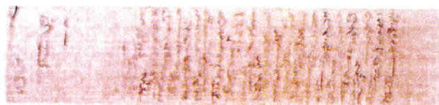
← A letter addressed to NAKARAI Tosui